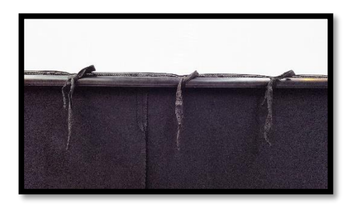
<u>Step 6</u> Once you are happy with the drape layout then you can start raising it up. Work your way around each of the uprights utilising its unique self-locking system that automatically locks the upright as you lift, raising until the entire structure has been raised to your desired height. Stand back to ensure your horizontals are level and make any adjustments needed.